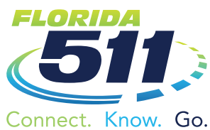
Florida 511 Logo – Full Color