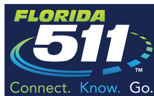
Florida 511 Logo – Full Color (Reversed)